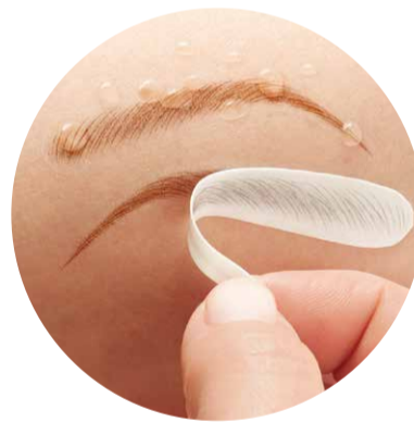
Eyebrow Transfer-Tattoo black brown or medium brown