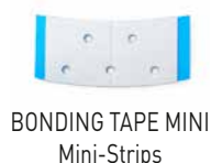
BONDING TAPE MINI Mini-Strips