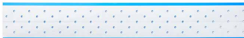
BONDING TAPE Strips