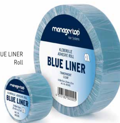
BLUE LINER Roll