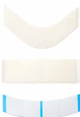
ULTRA TAPE Frontstrips