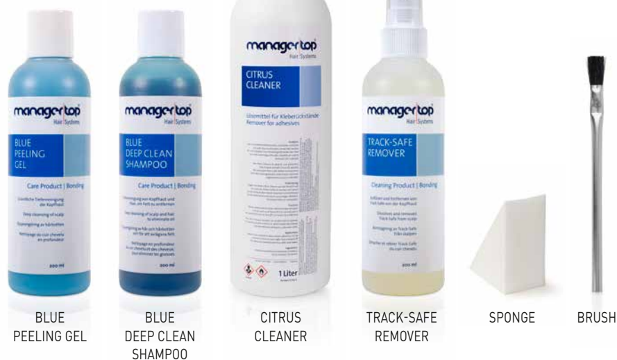
BLUE PEELING GEL