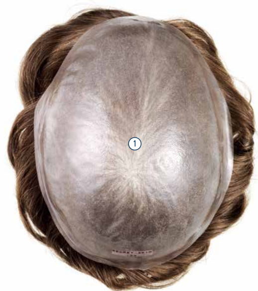
① thin transparent PU-Skin, G6

HUMAN HAIR SECRET-SKIN 26 x 19 cm strength G6 | 0.12 mm