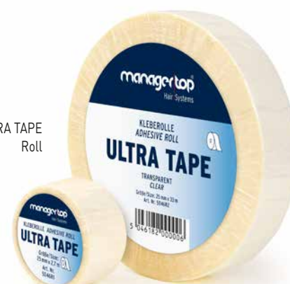
ULTRA TAPE Roll