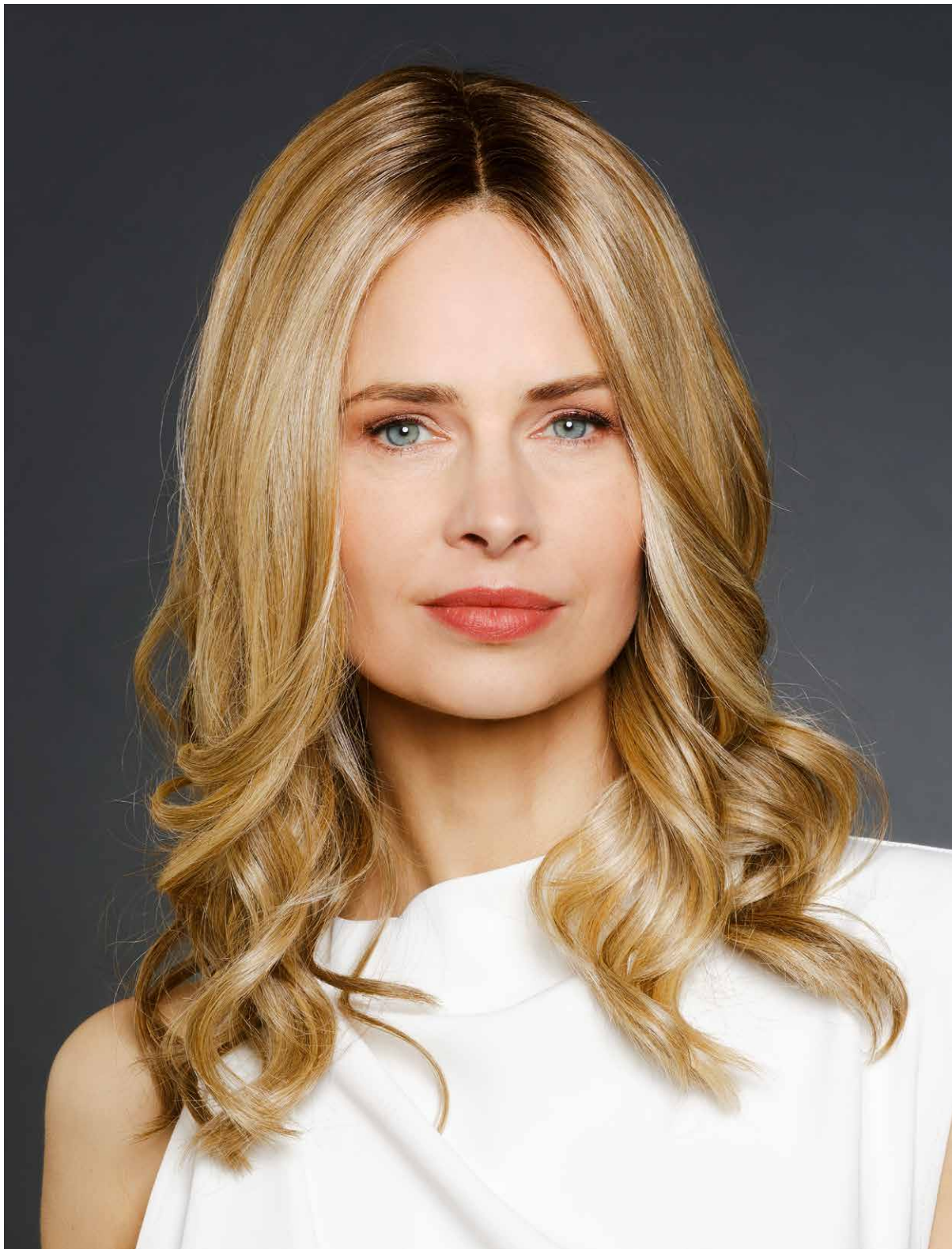
DELIA HI SF Vanilla-Mix-Root