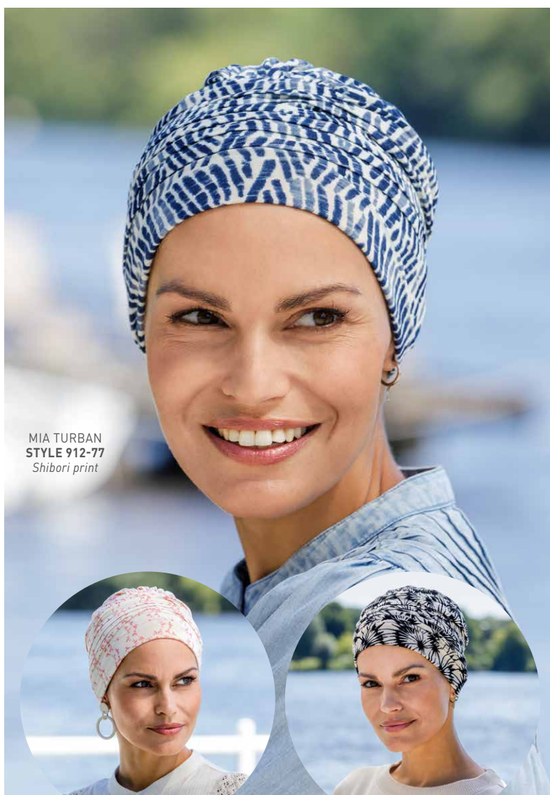
MIA TURBAN STYLE 912-77 Shibori print