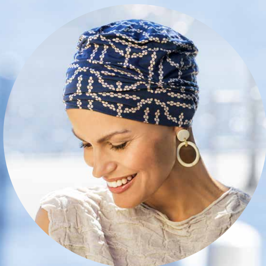
STYLE 911-80 chain print