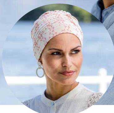
STYLE 912-79 blossom print