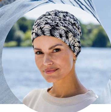
STYLE 912-78 black ikat print

The popular MIA TURBAN STYLE 912 also has a fresh new look – it is now available in three exciting new prints.