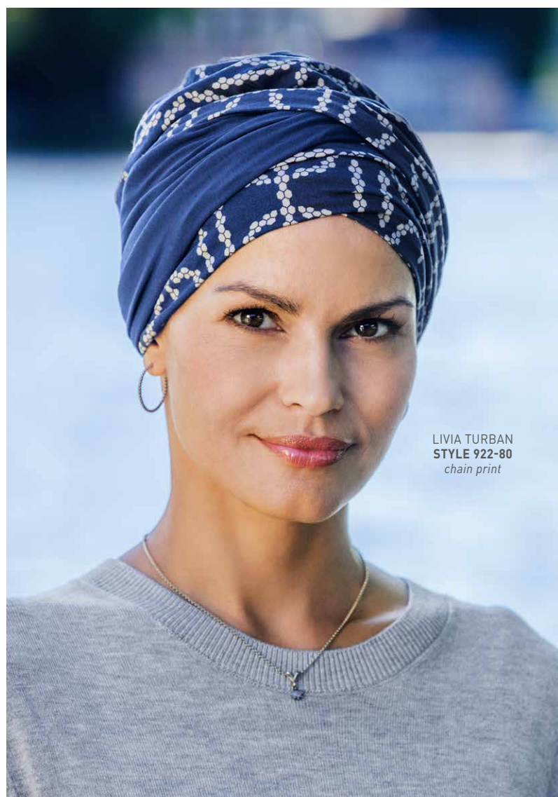
LIVIA TURBAN STYLE 922-80 chain print

The popular MIA TURBAN STYLE 912 also has a fresh new look – it is now available in three exciting new prints. ■