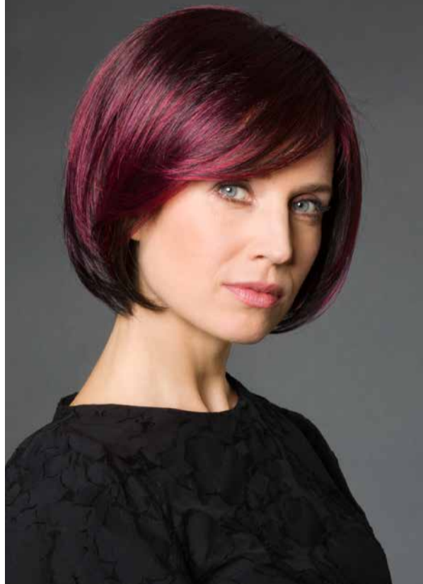
LEA MONO SF Black/Violett