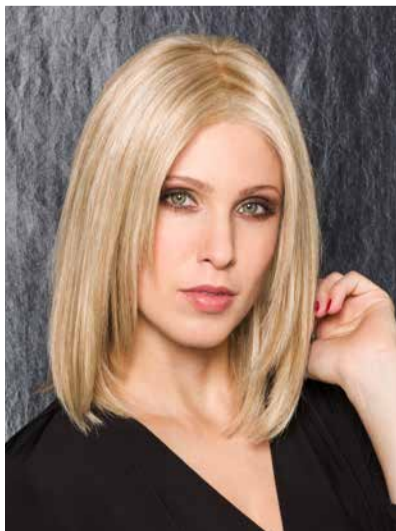
THE ELEGANT Light-Blond-Mix

A new dimension in terms of hair quality