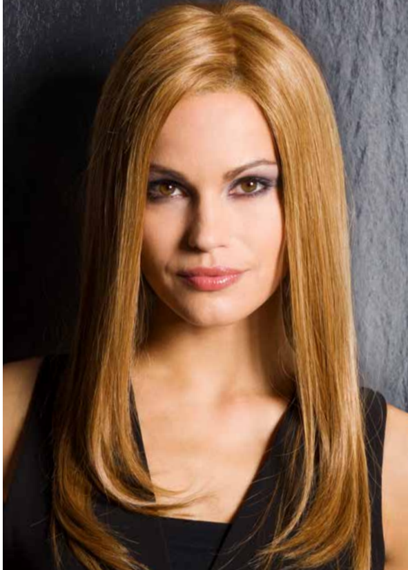
THE STARLET Light-Copper-Mix