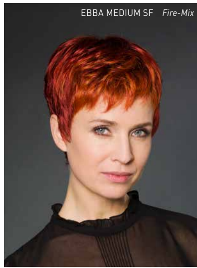
EBBA MEDIUM SF Fire-Mix