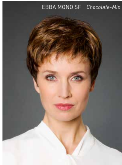
EBBA MONO SF Chocolate-Mix