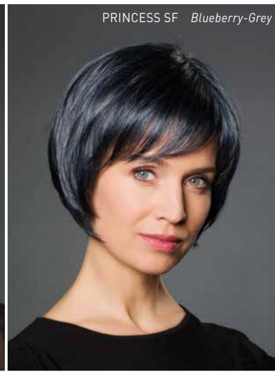
PRINCESS SF Blueberry-Grey