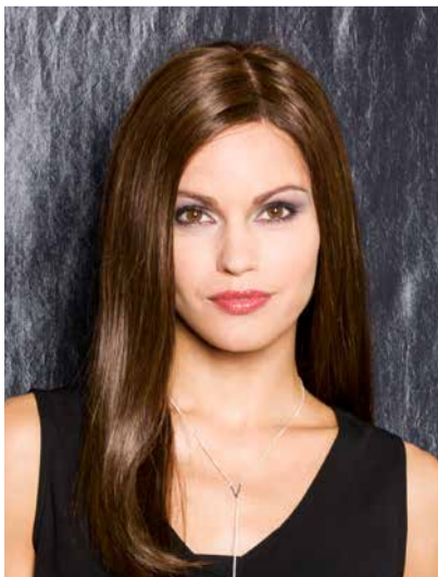
THE STARLET Mocca-Mix