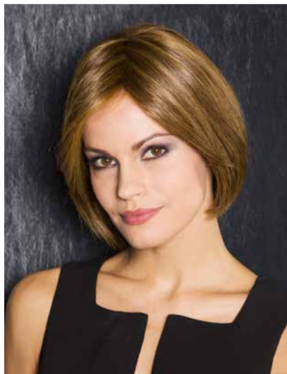
THE CHARMING Chocolate-Mix