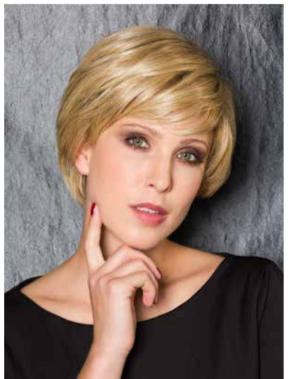
THE SMART Champagne-Root