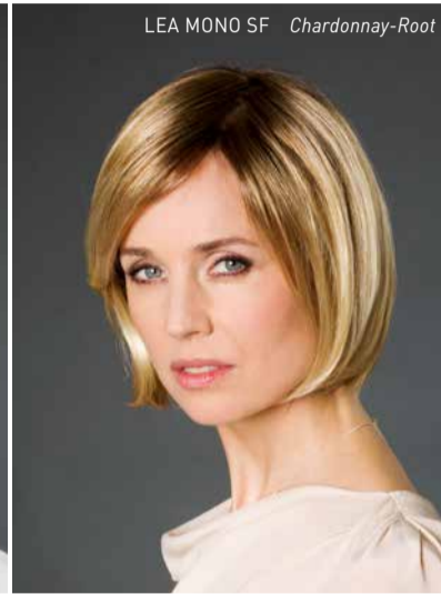
LEA MONO SF Chardonnay-Root