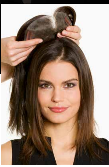
...can quickly fulfill a hair piece.