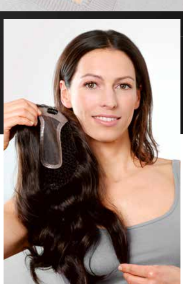
...with a BELLE MADAME hair piece.