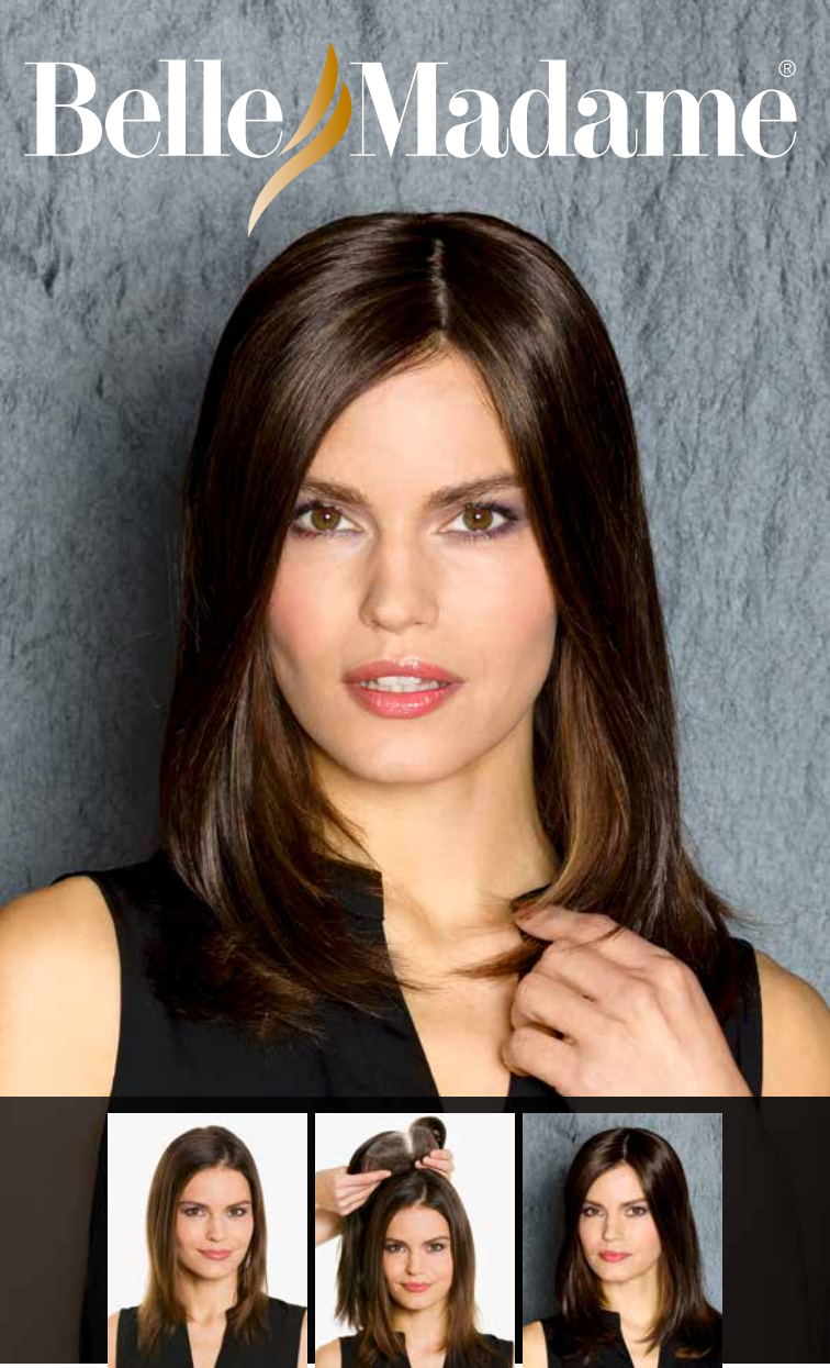
HAIR PIECES AND HAIR INTEGRATIONS